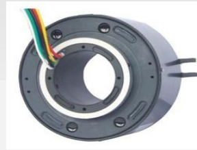
TB180292 Slip Rings

Continuous transmission of power and/or signal under 360° unrestrained rotation. Applies advanced fiber brush technology, free of maintenance or lubricating oil. Multi contact points in each circuit, low contact pressure, low noise, low contact wear; extremely long life-time. Standardized & modularized design; customized solutions also available.