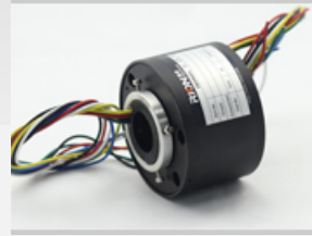
TB2586 Slip Rings

Continuous transmission of power and/or signal under 360° unrestrained rotation Applies advanced fiber brush technology, free of maintenance or lubricating oil Multi contact points in each circuit, low contact pressure, low noise, low contact wear; extremely long life-time Standardized & modularized design; customized solutions also available